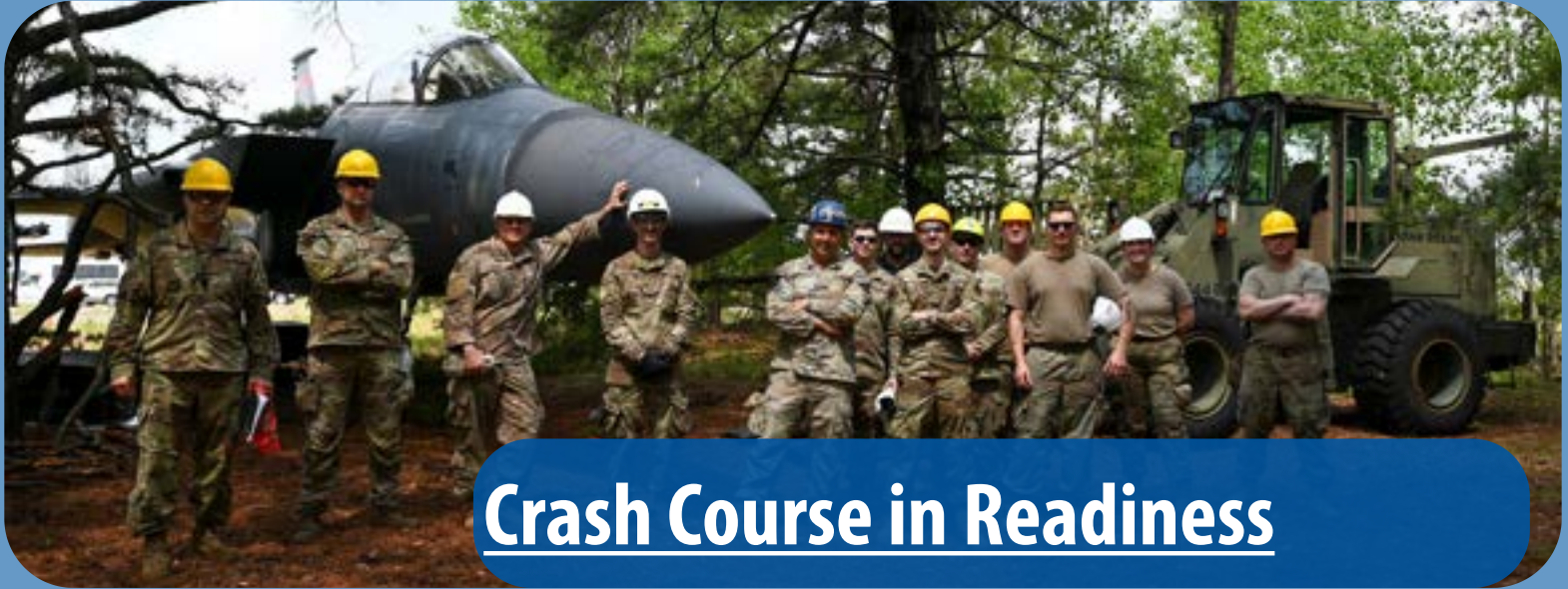
Crash Course in Readiness