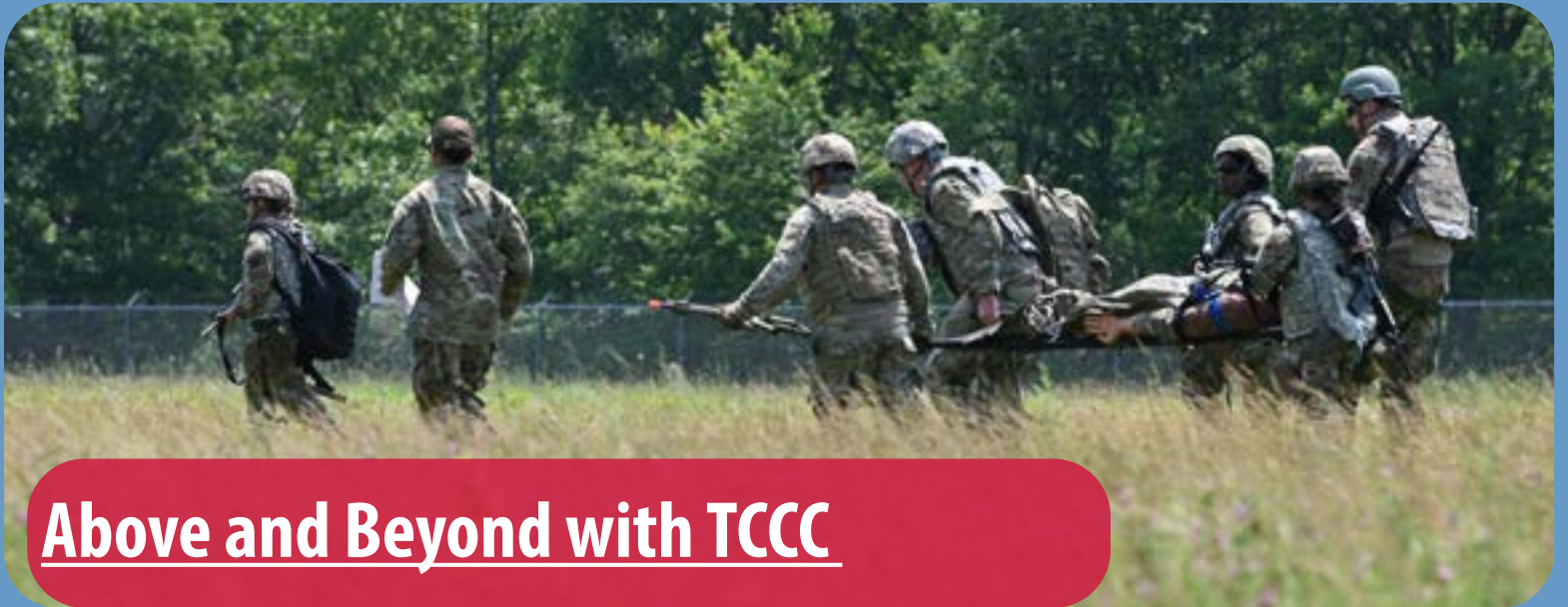
Above and Beyond with TCCC