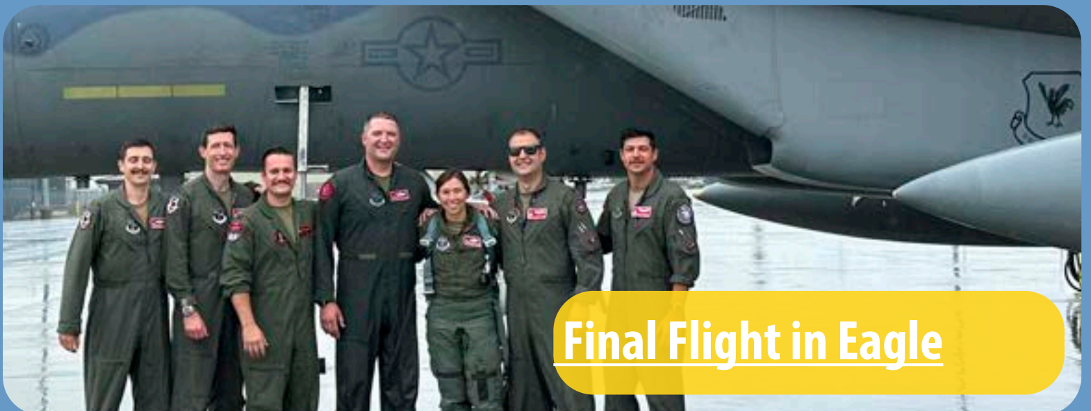
Final Flight in Eagle