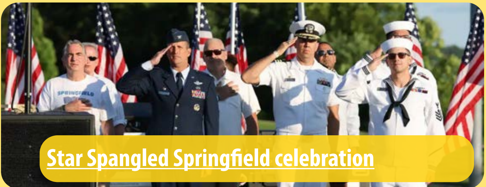
Star Spangled Springfield celebration