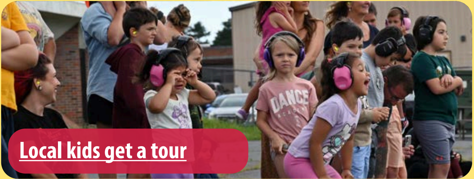
Local kids get a tour