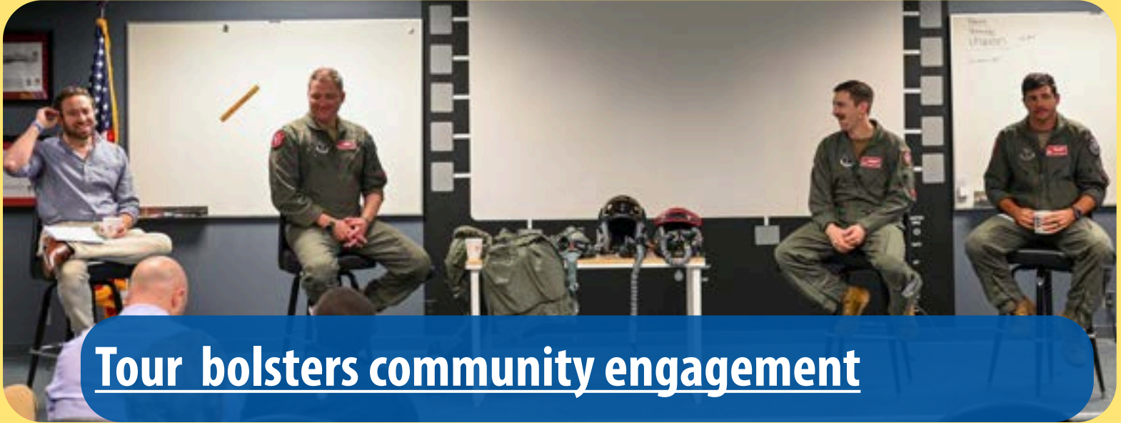
Tour bolsters community engagement